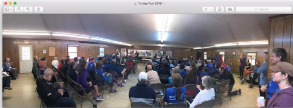
Awards Ceremony, 2016 Turkey Run

This annual event is held on approximately 4 miles of beautiful trails through the Duke Forest and is open to runners and walkers. Next year's race is on November 11 th – mark your calendars now! Read about last year's race: http://www.newsobserver.com/news/local/community/chapel-hill-news/article115387323.html