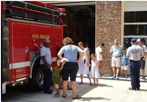
Hollow Rock Nature Park opens and the Hollow Rock Store comes home!

More than 70 people attended this event in July which featured music, games and ice cream. The most popular event was the Bouncy House and the NHVFD got to show off their new fire engine.