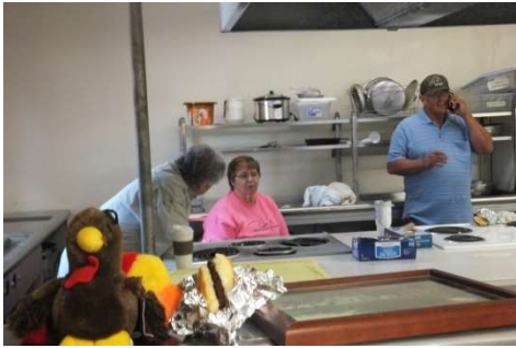
Kitchen crew-Carter & Higginbothams