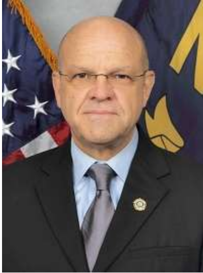
Sheriff Charles S. Blackwod

vehicles or anything that is out of the ordinary. Crime prevention tips and identification of scams were discussed at length. Community policing and building relationships with the varied communities served by the Sheriff of Orange County were among the topics of discussion. Lighter topics included the new uniforms, new police cars and a new logo.