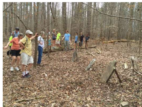
Robson Mill Hike