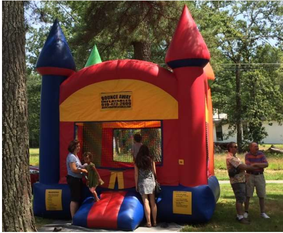
l. Bouncy House