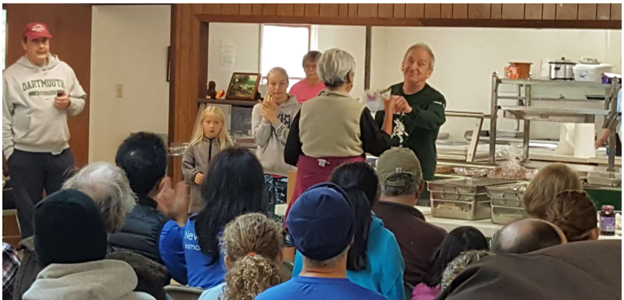
Senior Winner receives prize