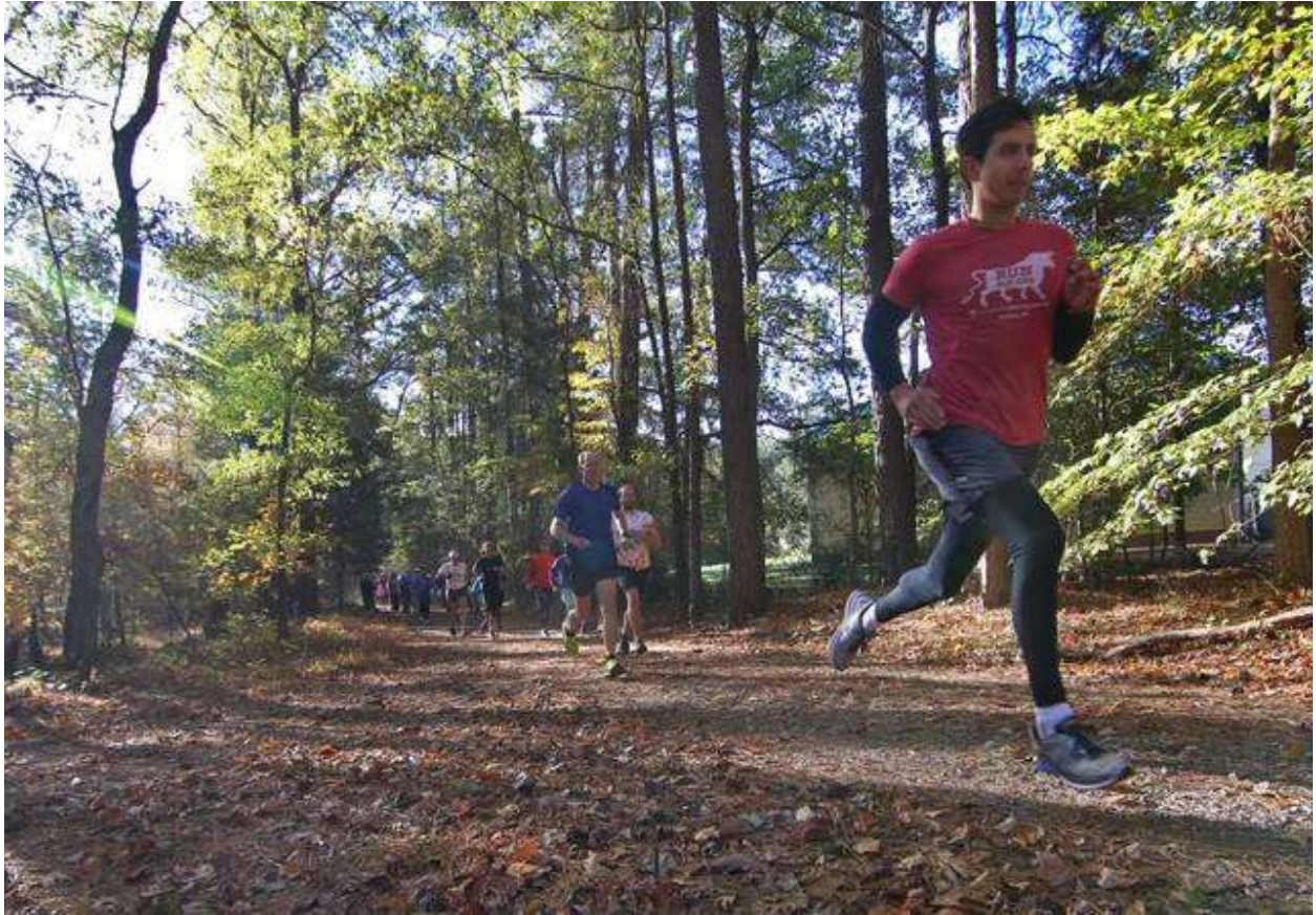
Turkey Run November 12, 2016 Runners on Trail.