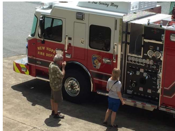
r. New engine