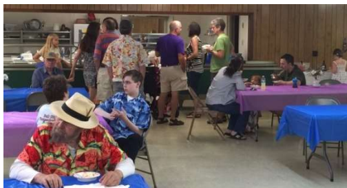
Enjoying ice cream

gallons of ice cream, and jars and jars of chocolate fudge, chocolate, strawberry, butterscotch toppings, and cans of whipped cream, and pineapple and cherries, jimmies and sprinkles. It was all gooey fun. Even better than the ice cream was the bouncy house and a visit to the brand spanking new fire engine purchased by the New Hope Volunteer Fire Department. More than 80 adults and kids came for all the fun.